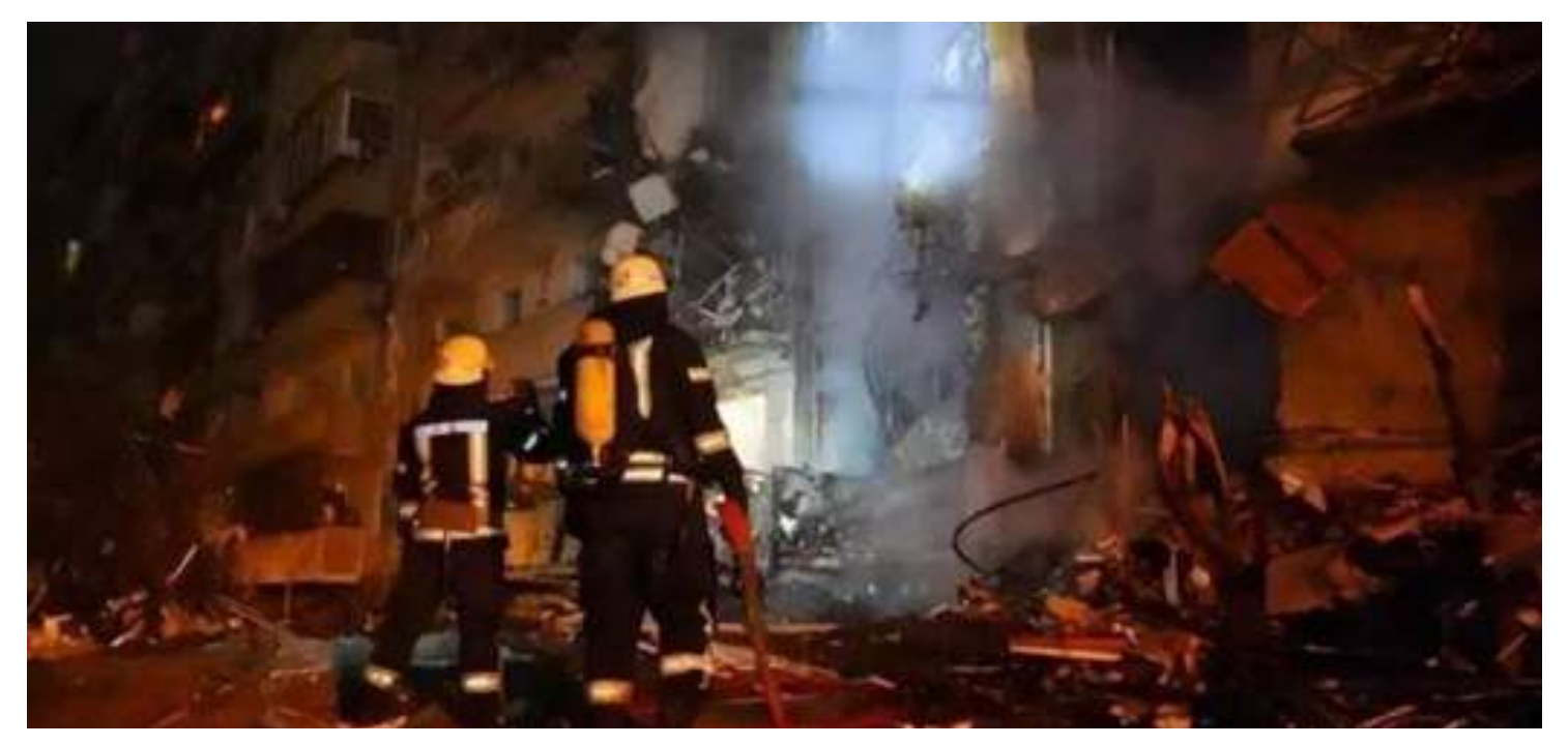
PHOTO: One of our Langham Preaching partners shows just a glimpse of the devastation they face.