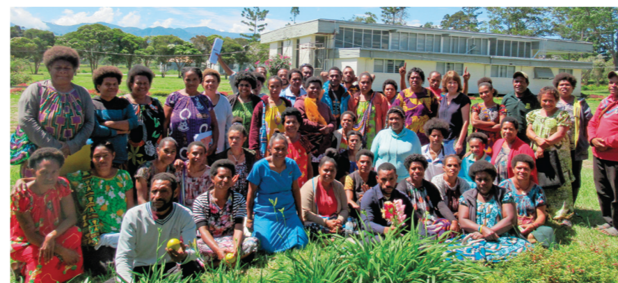
Students in the Early Childhood Education Certificate program.