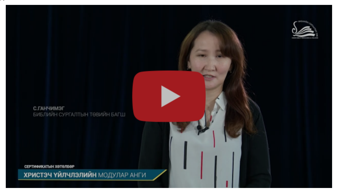
Христэч үйлчлэлийн модулар анги

Since last August, UBTC has been diligently engaged in the real work of renovating and transforming the Chapel and another room into a multimedia space. This ambitious project received approval from the UBTC Board, with a total budget of $56,215 USD. We wish to convey our heartfelt appreciation to our valued partners who have played a pivotal role in making this project possible: Australian Local Leaders International, FCBC Walnut Church in the US, and the LeaDev Langham organization in New Zealand.